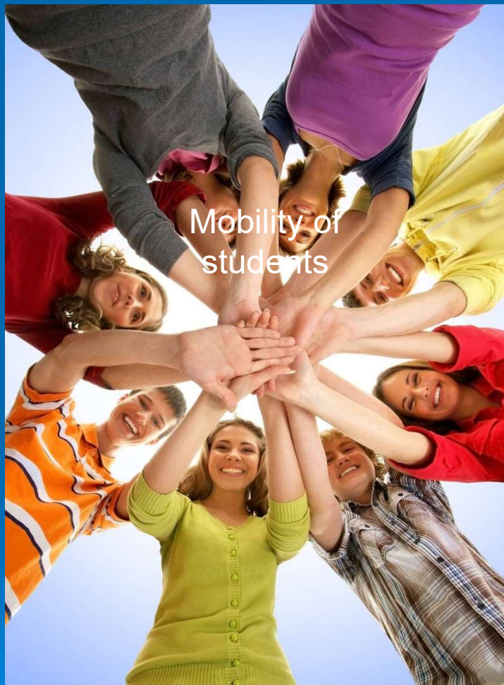
Mobility of students