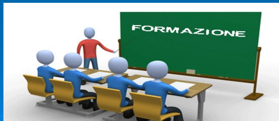
Training courses on social skills for teachers