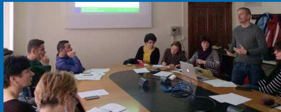
Meeting for teachers to program end evaluate activities